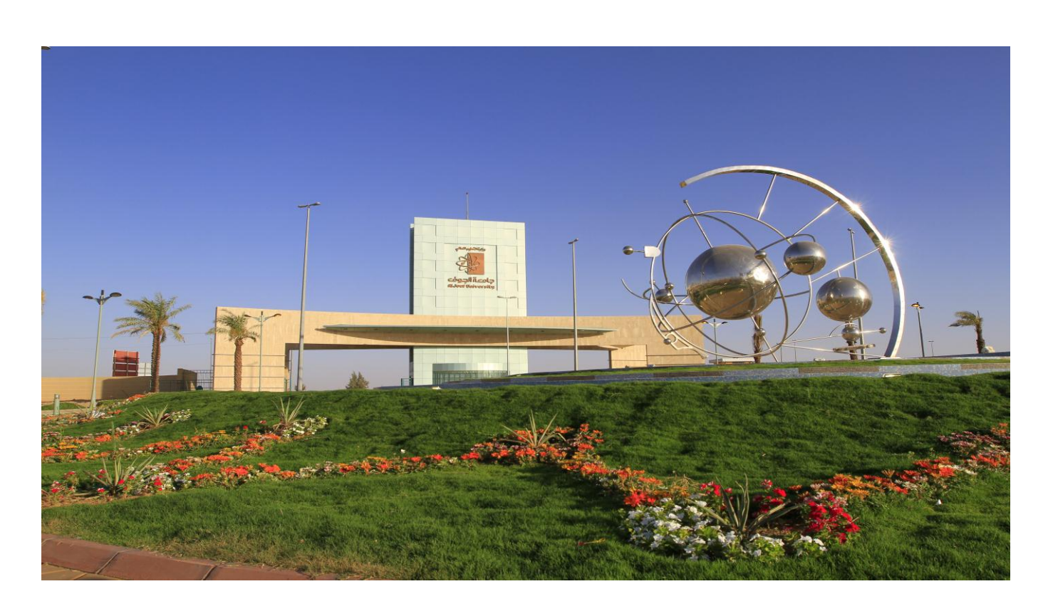
Manual of Intellectual property rights protection policy at Al-Jouf University